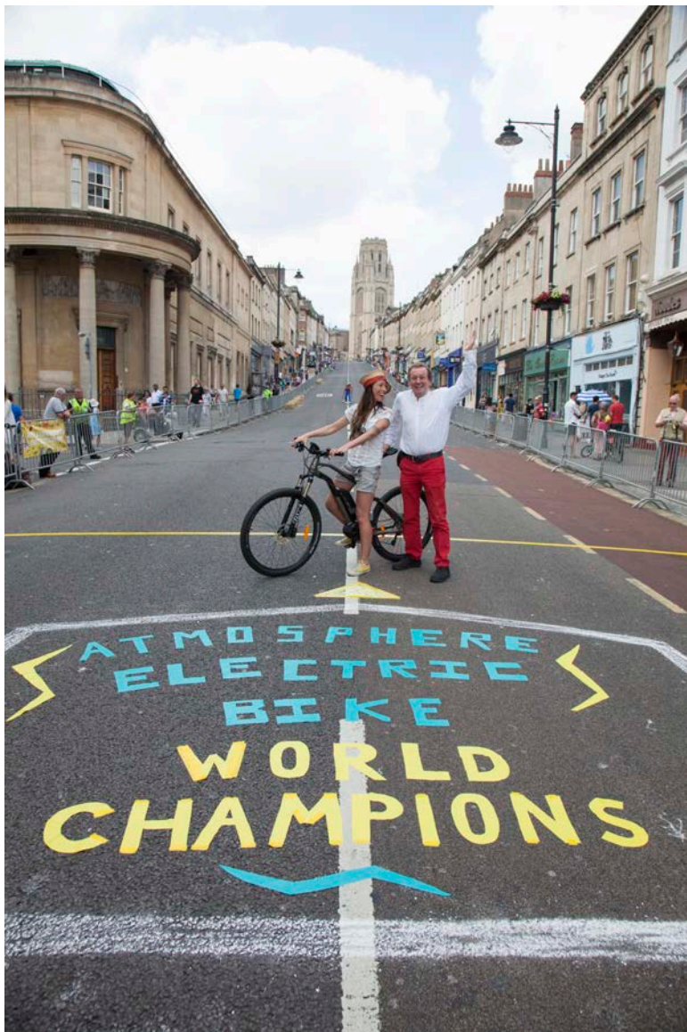
Mayor George Ferguson

Role models for behaviour change can come in many forms: relatives, teachers, managers at work 1 . However it is perhaps essential that leaders in a city wanting to see policy change must, where possible, authentically 'live' that change, to establish credibility. George Ferguson, the Mayor of Bristol, is regularly seen out and about on his bike, as are leading figures in the business and education community, as well as many people working within the city council.