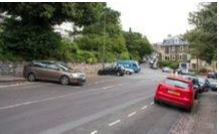
After RPS in Clifton Village