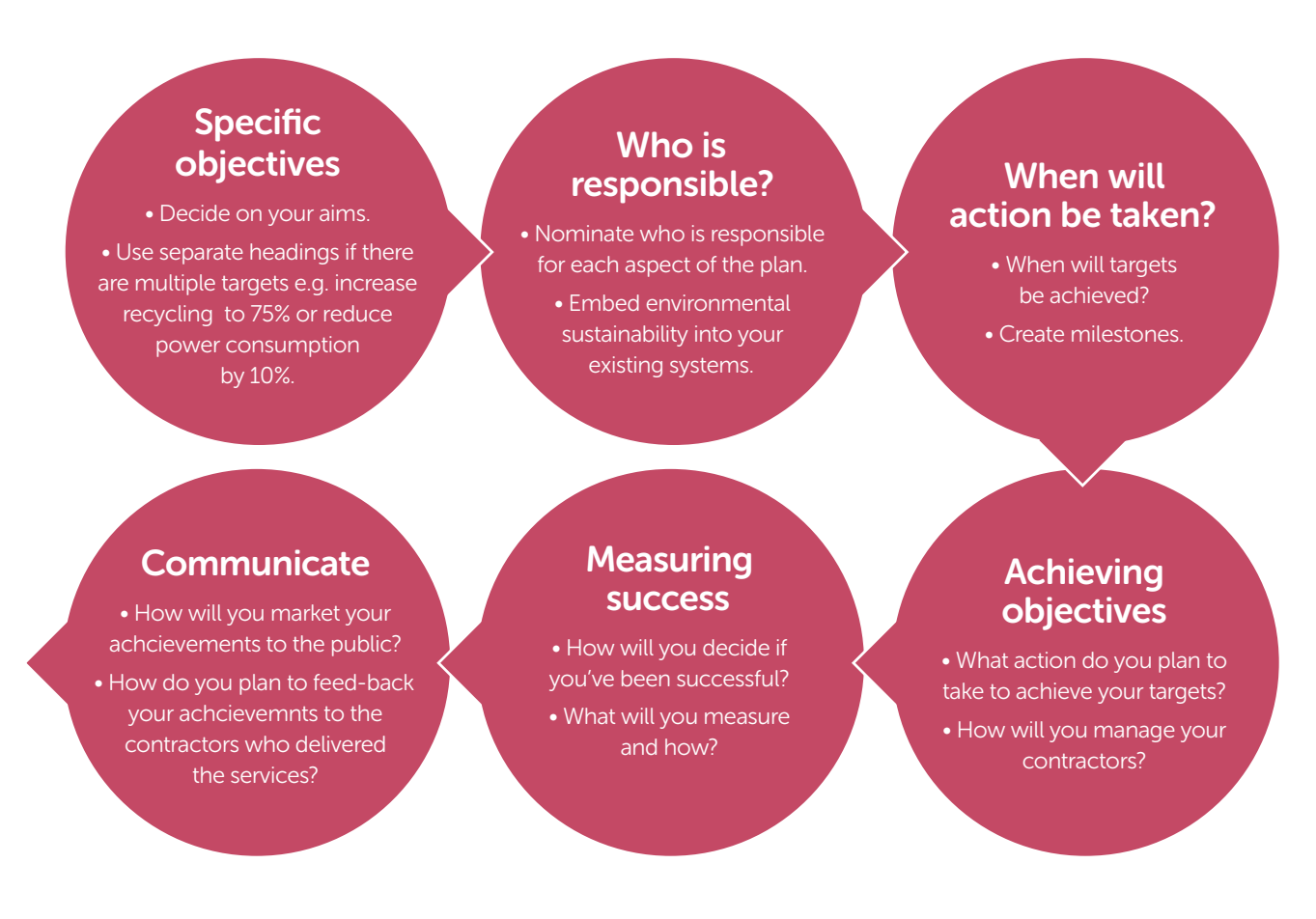
Figure 4: Summary of contents for a green action plan.

An action plan is a short planning document which clearly sets out targets for reducing impacts; detailing how you expect to achieve them. As indoor venues and events vary considerably due to type, size, audience profile and location, your action plan will be unique to your company and building. Figure 4 below summarises the main things to put in your action plan.