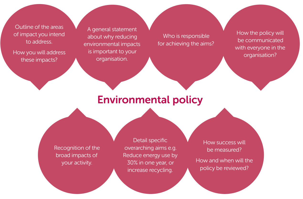
Figure 3: Steps to making an environmental policy.

the policy represents real understanding of opportunities to reduce impacts. It is usually a short document of one or two pages; Figure 3 shows some of the things to include.