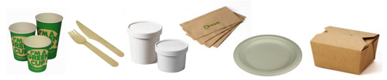
Figure 5: Examples of compostable serve-ware.

If disposables are the only option for serving food for any reason, use compostable serve-ware to reduce the impacts of the materials you use and so that it can be composted with food waste – recyclable material such as PET plastic and metals often cannot be recycled if contaminated with food.